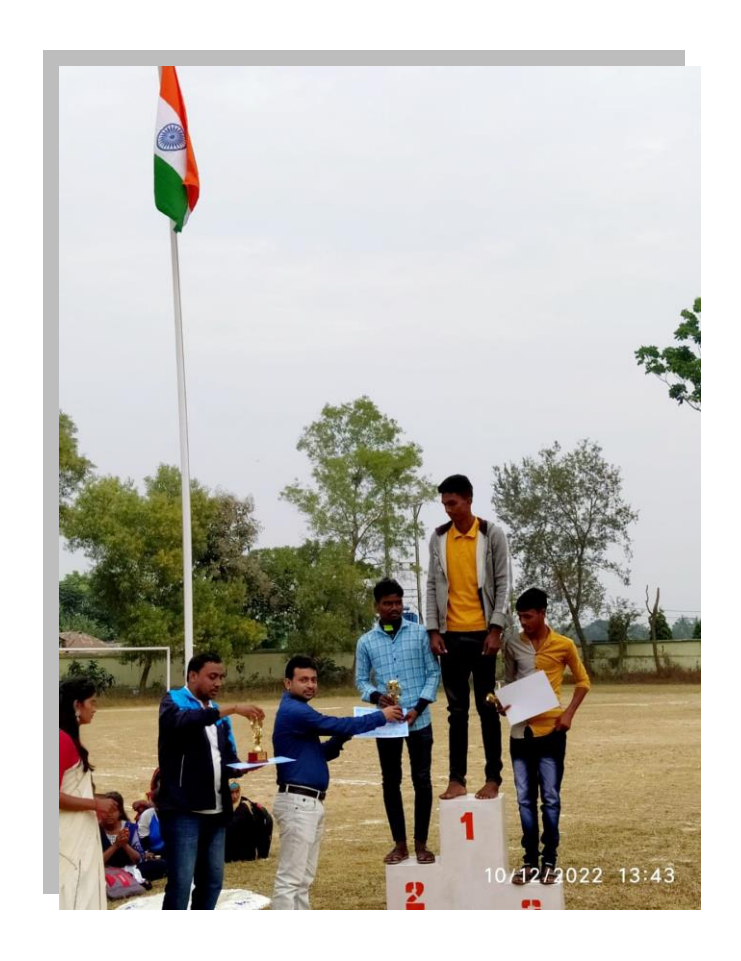
Prize Distribution on Annual Sports