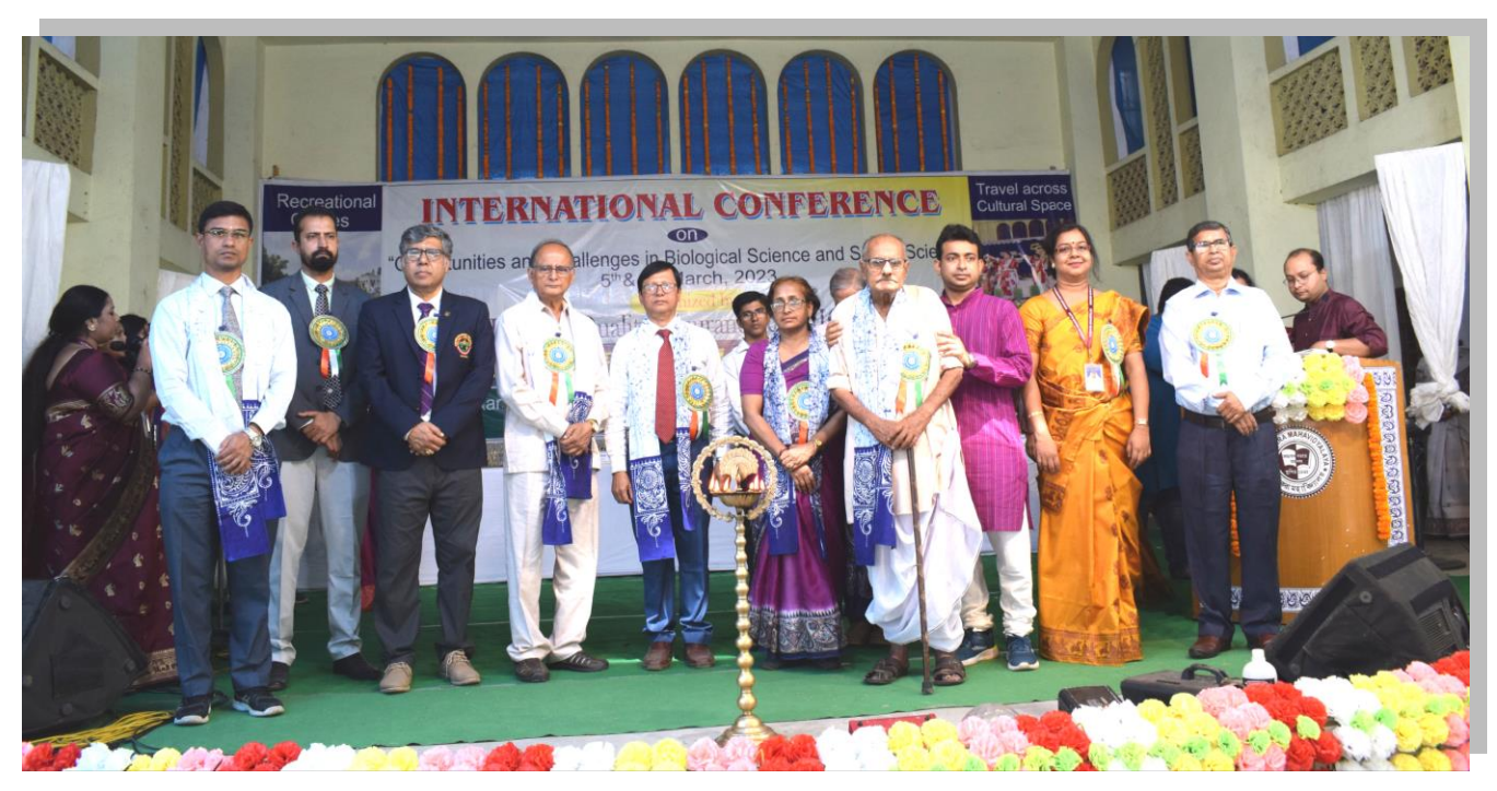
Inaugural Ceremony of International Conference on 5<sup>th</sup>& 6<sup>th</sup> March, 2023