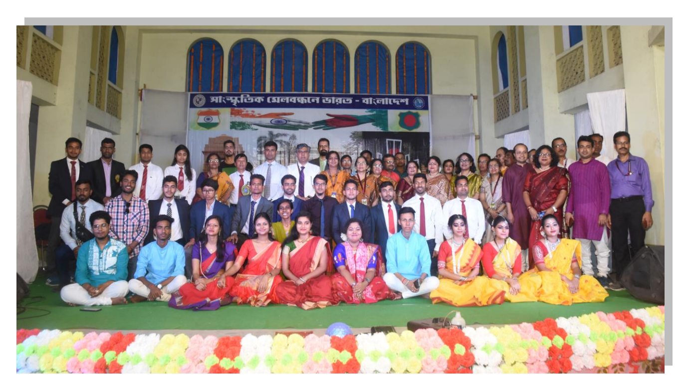
Cultural collaboration between India and Bangladesh on 5th & 6th March, 2023