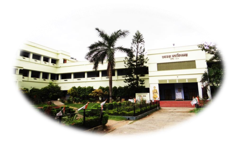
Main Building of the College