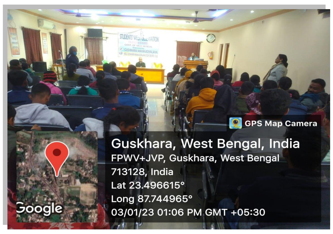
Observation of Students Week