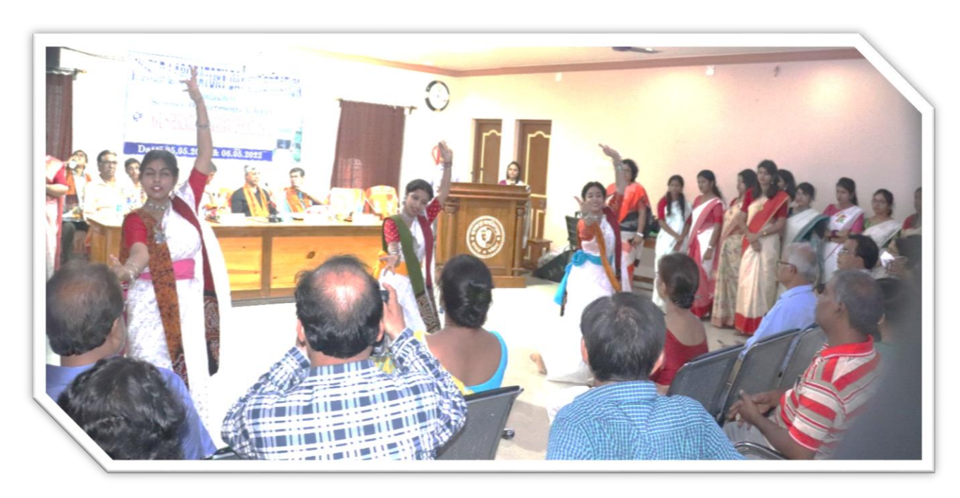
Inaugural Ceremony of World Laboratory Day