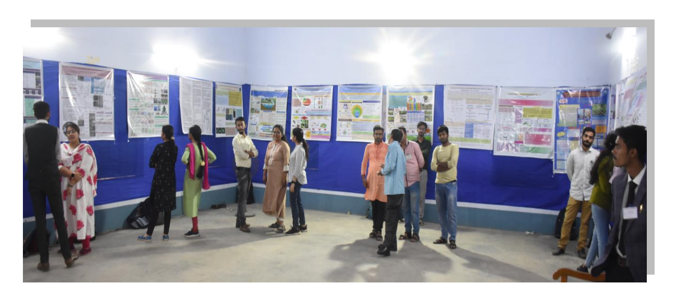
Poster Presentation on International Conference