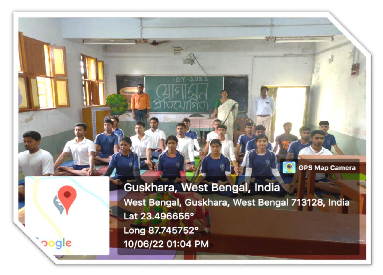
Yoga Competition on International Day of Yoga 2022