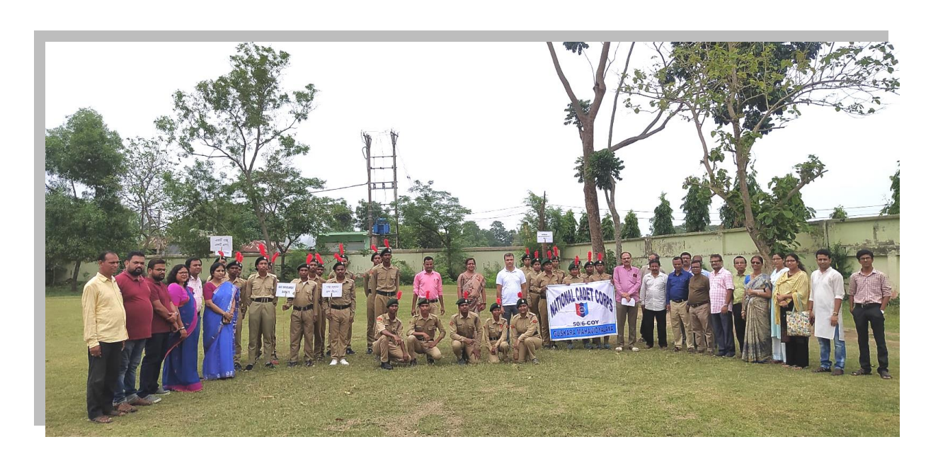
Tree Plantation on World Environment Day by NCC