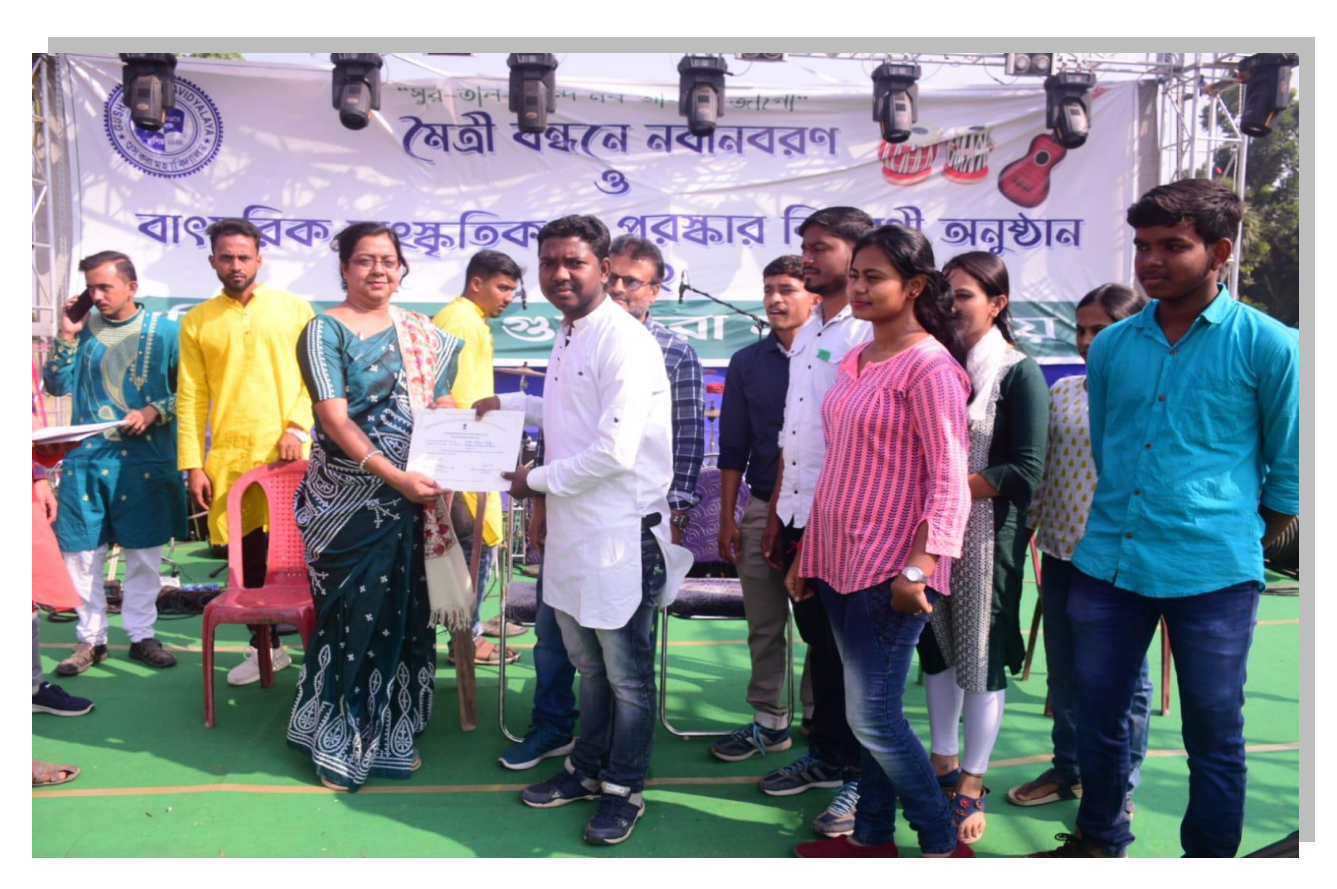
Annual Cultural Programme