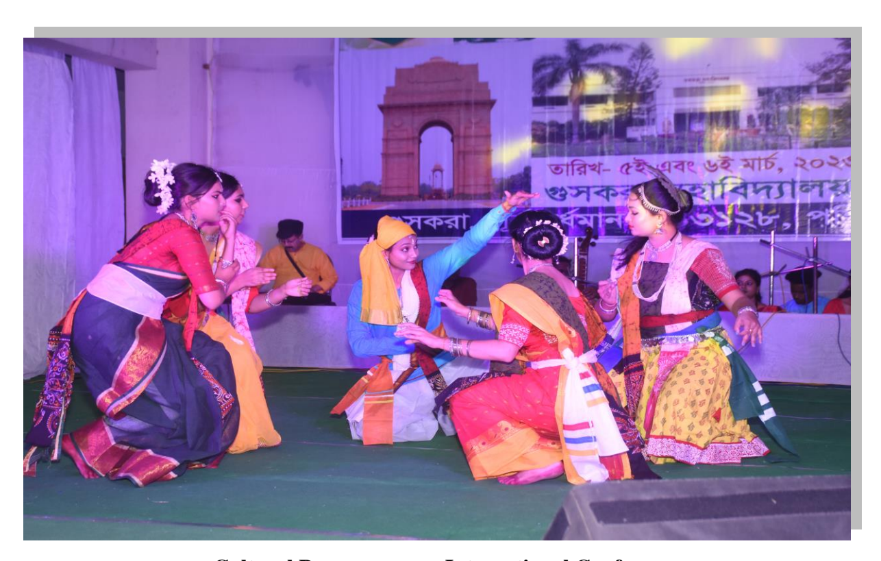
Cultural Programme on International Conference