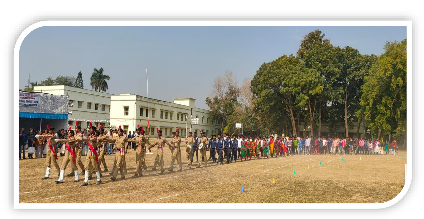
NCC, NSS Volunteers and Participants in Annual Sports